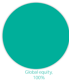
ASSET DISTRIBUTION BY GEOGRAPHICAL